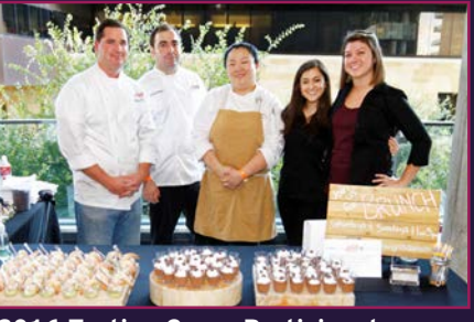
2016 Tasting Grove Participant