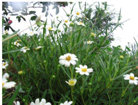
Blackfoot Daisies in full bloom in the Children's Healing Garden